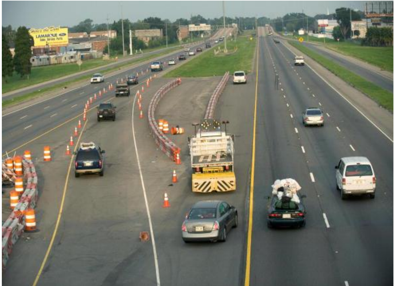
Figure 5. Photo. Contraflow Traffic Begins on Westbound I-10 in Metairie in Jefferson Parish prior to Hurricane Gustav.

LA DOTD revisits plans annually to ensure accuracy, as well as to incorporate plans for ongoing construction activities on contraflow corridors.