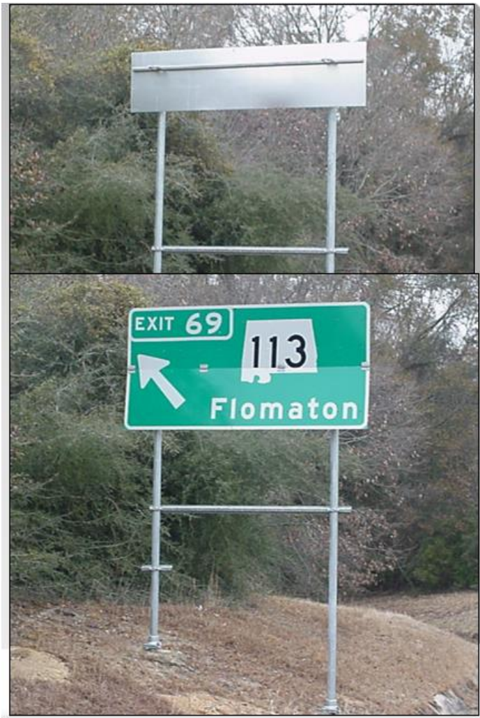
Figure 3. Photo. Flip down sign used for contraflow purposes on I-65 in Alabama.

Alabama DOT staff identified that the Governor of Alabama has sole authorization to activate contraflow operations.