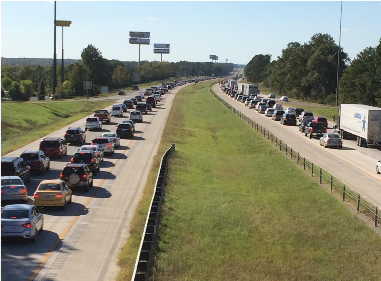
Figure 4. Photo. Contraflow operations on I-16 in Dublin, GA prior to Hurricane Irma.

GDOT reported that this deployment was successful and gave motorists adequate capacity to evacuate successfully.