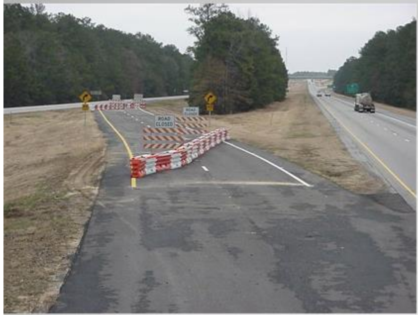
Figure 2. Photo. Permanent median crossover on I-65 in Alabama.

The Alabama Department of Transportation (ALDOT) sees contraflow operations as a last resort option for hurricanes, only to be used in the most severe situations when mass evacuations are required. ALDOT initially developed a contraflow plan for I-65 in 2000. Currently 130 miles of I-65 in Alabama can be availed of for contraflow traffic evacuating inland from coastal areas including Mobile. ALDOT staff has identified I-65 due to their concerns that without the additional capacity of contraflow operations it would be unable to handle potential demand during an evacuation scenario. ALDOT maintains a public website containing an overview of contraflow plans.