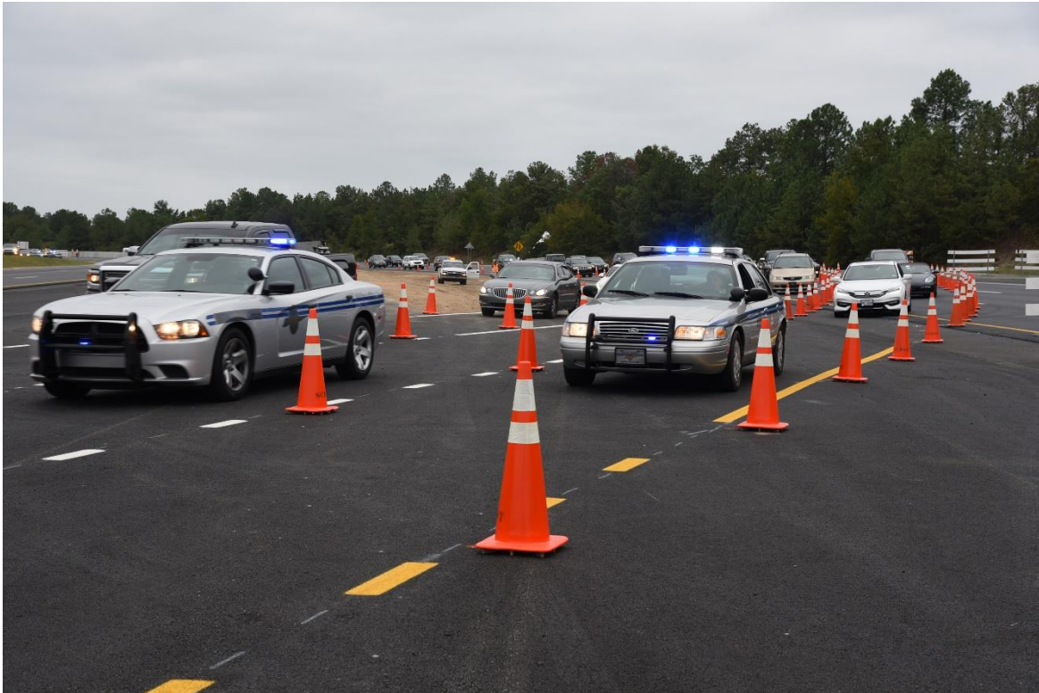
Figure 6. Photo. Law Enforcement Vehicles Lead Evacuating Drivers Through a Crossover near the I-26/I-77 Interchange During Hurricane Matthew.