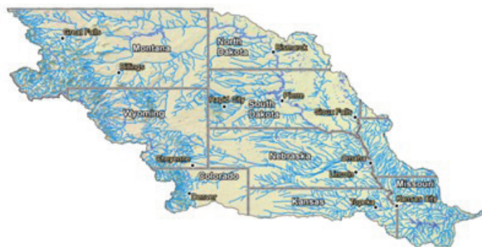
Figure 1. The Missouri River Basin is in the north central United States

DOTs rely on a variety of data and tools to predict and prepare for a significant flood event. Experience helps staff understand the spatial relations between the height of a roadway and how it will be impacted by a certain water level, in conjunction with models that examine inundation at various