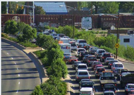
Traffic backed up on NB Wadsworth prior to the project. Restaurant (blue roof) had to be relocated.

Train traffic (especially) and vehicles on Grandview Avenue would routinely block traffic on Wadsworth Boulevard. Emergency response in the vicinity was complicated and expensive, requiring two calls at all times – one for each side of the tracks – in the event that a train would come through.