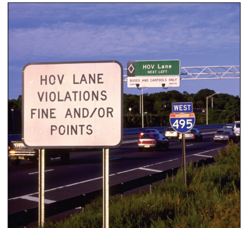
Future I-495 Express Lane, Virginia

but in fact achieved 1,400 in the first year of operation. Use of the I-25 HOT lanes has grown by almost 18 percent since the HOT lanes opened in 2006 and the lanes remain uncongested. Additionally, transit ridership in the HOT lanes has remained high.