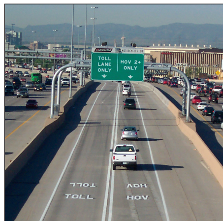
I-25 Express Lane, Denver

Like their HOV counterparts, HOT lanes have the potential to help improve air quality where they are implemented. High-occupancy lanes might help to reduce harmful impacts to the environment associated with congestion, especially by encouraging the use of multi-passenger vehicles or mass transit systems. On SR 167 in Seattle, general purpose lane speeds increased 10 percent and HOT lane speeds increased 7-8 percent and transit ridership increased 16 percent from the year before implementation of the HOT lane. As a result, the federal government allows HOV lanes to be considered a transportation control measure (TCM) for air quality conformity analysis.