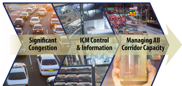
Figure 2. Figure. Solving congestion problems using integrated corridor management.

Integration of ICM and congestion pricing also provides the opportunity to enhance TIM within the corridor. In case of incidents, crashes, emergency, special events, or construction, dynamically adjusted toll rates help to adjust the traffic flow accordingly.