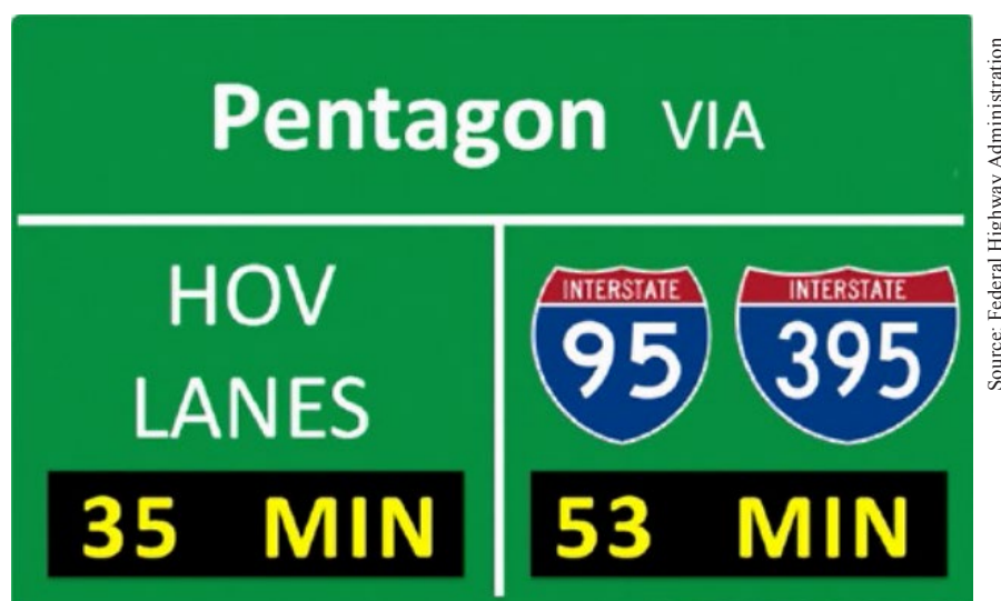
Figure 9. Illustration. A dynamic traveler information sign that indicates travel time via high-occupancy vehicle lanes versus normal travel lanes.

Another challenge concerns the amount of information on signage in advance of managed lanes access points. Price-managed lane facilities are already faced with information overload on signage in advance of access points, as shown in Figure 9. Combining pricing strategies with ICM strategies could exacerbate the problem, as even more information needs to be conveyed to drivers. The Manual on Uniform Traffic Control Devices (MUTCD) has explicit limits on the spacing of signs and the amount of information to be placed on each sign.