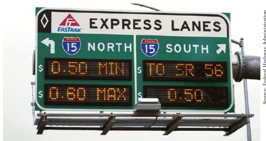
Figure 7. Photo. FastTrack Express Lanes pricing information.

An ICM approach, on the other hand, takes a multimodal view and seeks to divert traffic and travelers to the most efficient route or mode based upon current conditions and asset availability. An event such as congestion in general purpose lanes due to lane closures or an extreme event would, under an ICM scenario, require directing traffic onto priced lanes if there is excess capacity available there in order to flush the system until congestion subsides. But such a diversion would compromise the rationale for collecting revenue for the time that the priced lanes are used to flush the system. The threshold for such instances and the response to the resulting situation of conflicting goals could be an operational challenge that needs prior determination of operational policies as demonstrated by the MnPASS I-394 example.