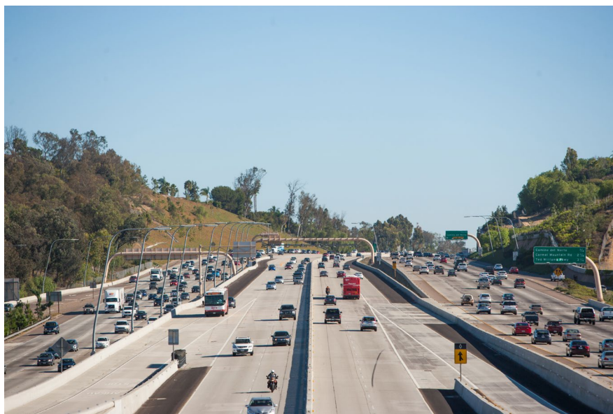
Figure 5. Photo. Managed and freeway lanes on I-15 in California.

The I-15 corridor in San Diego, whose ICM implementation is overseen by SANDAG, and exemplifies a multijurisdictional integration of several multimodal demand management strategies including pricing across multiple stakeholders. The corridor is situated within a major interregional goods movement corridor connecting Mexico with Riverside and San Bernardino counties in California as well as Las Vegas, Nevada. The management of traffic flow between the managed lanes (shown in Figure 5) and general purpose lanes is achieved by means of a coordinated approach among several of I-15 corridor's institutional stakeholders, including SANDAG, the California Department of Transportation (Caltrans), and the California Highway Patrol (CHP). This corridor exhibits an excellent example of collaboration and partnership among various agencies.