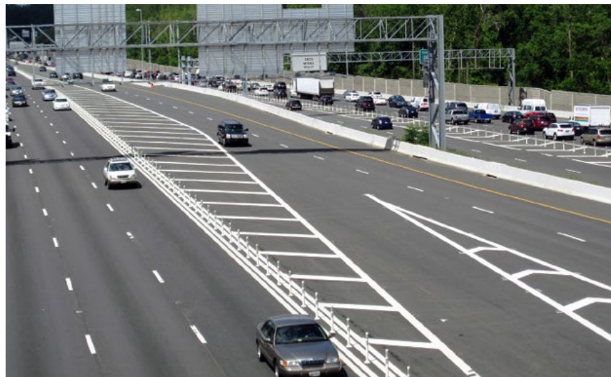
Figure 8. Photo. An example exit point from managed lanes.

The process of integrating ICM strategies into an existing priced managed facility can encounter several technical challenges. Managed lane access points are of particular concern in terms of their frequency, capacity, design characteristics, and locations. As seen in Figure 8, design of access and exit points on managed lanes are quite different than basic lane changing practices.