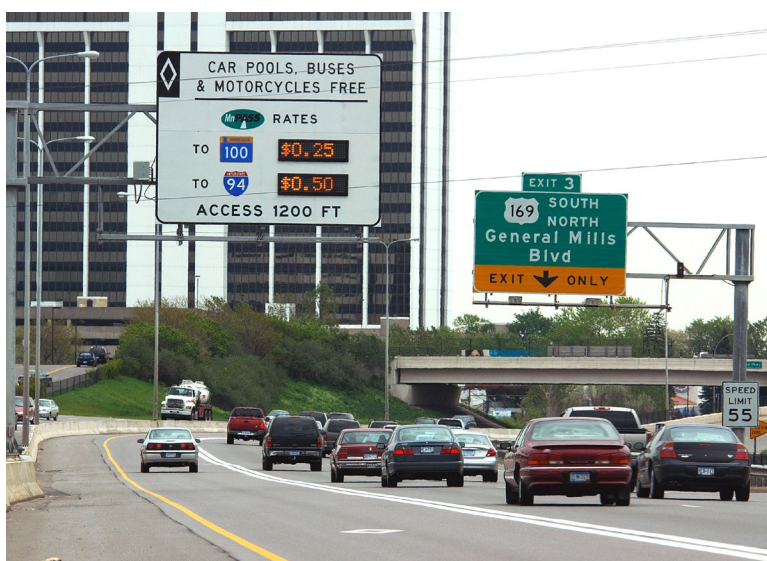
Figure 6. Photo. MnExpress Lanes on I-394 showing rates.

Real-time sharing of information between agencies can help smooth the flow of traffic along a corridor. Agencies can make decisions in response to conditions and incidents, such as opening an express toll lane for all traffic for free in instances of extreme congestion. Such policy decisions can be made under an ICM framework to allow the flexibility to best utilize the available capacity under extreme circumstances. The Minnesota DOT (MnDOT) I-394 Value Pricing Program demonstrates how this operational integration