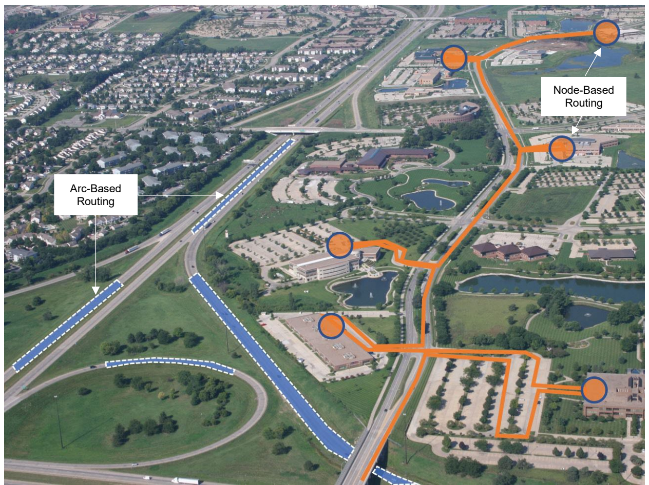
(annotations to show routing added).

The calculations behind route optimization are solving either node- or arc-based problems. Solutions to the node-routing problem, often referred to as the vehicle-routing problem (VRP), identify service points (like customer address) as nodes in a network and find the best routes to service each of the customers (nodes). On the other hand, solutions to arc-routing problems (ARP) find the best routes to visit all the segments (called arcs) of a network. Figure 4 provides an illustration comparing these two types of problems, with node-based routing in orange and arc (segment)-based routing in blue.