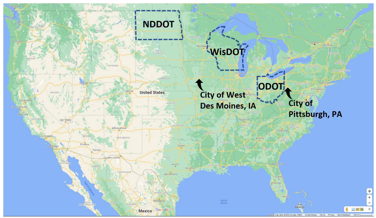
Shading, pins, and text added by FHWA to indicate surveyed agencies.

The FHWA Road Weather Management Program (RWMP) recently conducted interviews with five transportation agencies that have considered or are using route optimization. This includes three State DOTs and two local agencies, as shown in Figure 6.