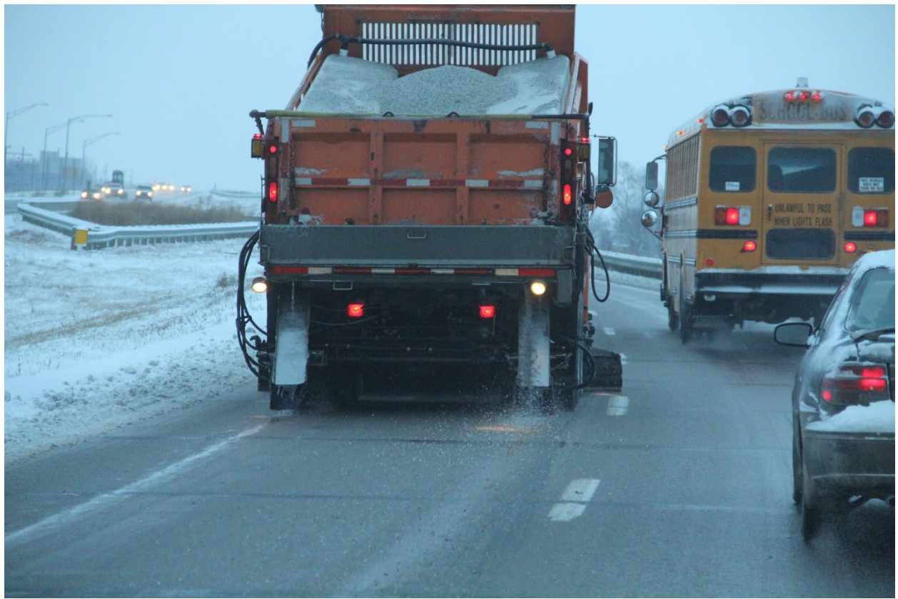
© 2021 CWIMS at Iowa State University.

As shown in Figure 2, winter operations include the removal of snow and ice on roadways and the application of materials to improve road conditions for safe travel. In general, snowplow routes are developed based on past experiences and expected weather conditions. Route efficiency, over time, is dependent on these conditions remaining constant with no new lanes added to the route, storm severities staying within expectations, and available resources remaining consistent year after year (labor force, equipment, and materials). In reality, transportation agencies face a wide range of changing conditions each winter, which reduce route efficiency and lead to increased labor and materials costs, reduced roadway safety, and gaps in traveler expectations.