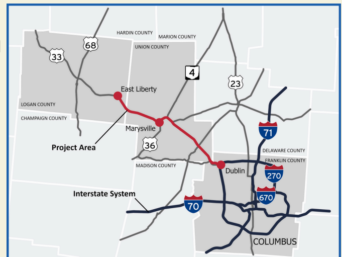
Figure 1. Map. Project map.